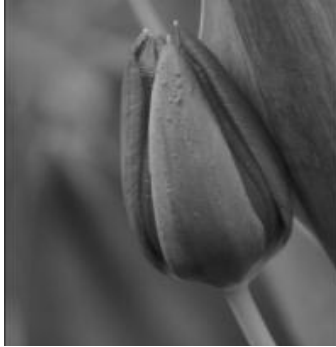
Fig 3. Keywords: "flower", "tulip", "plant"

First method is used in the smaller and highly specified web sites, where the key words precision is very important (for example scientific articles, news). In this case, qualified person is assigning the most appropriate tags to the particular content. This method allows more precise mapping of the content features but it requires high amount of work done by the persons responsible for tagging. It is almost impossible to use this method in the biggest web applications that contain tons of user specific data.