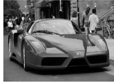
Fig 4. Sample photo uploaded by a user

With a keywords 'Ferrari', 'Car', '2012', then the following photo may be represented by the following binary vector: