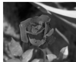
Fig 2. Keywords: "plant", "rose", "flower"