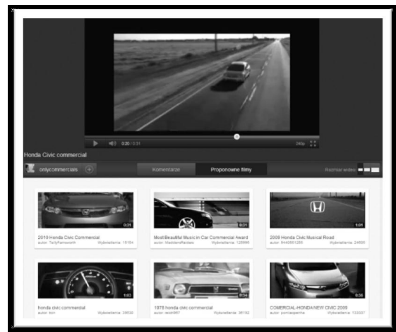
Fig 1. Sample Youtube video page with related content – in this case Honda Civic commercials

tions. The simplest and most popular method of classification of any content is the key words (tags) assignment system.